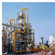
Paper & Pulp